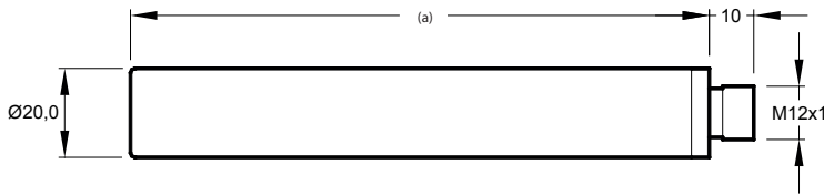
Connection M12x1 connector